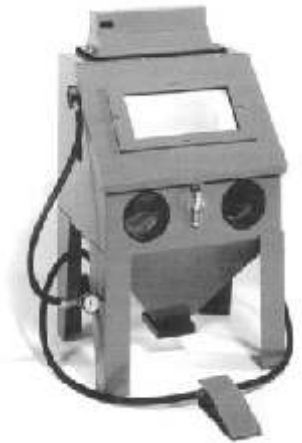
MINI B BENCHTOP SYSTEM