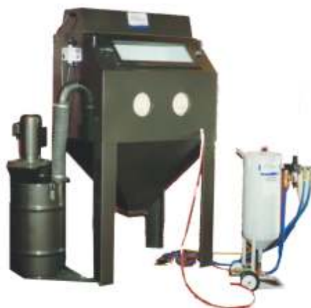
PB2436 PRESSURE POT SYSTEM Great Prices on Second Hand Units