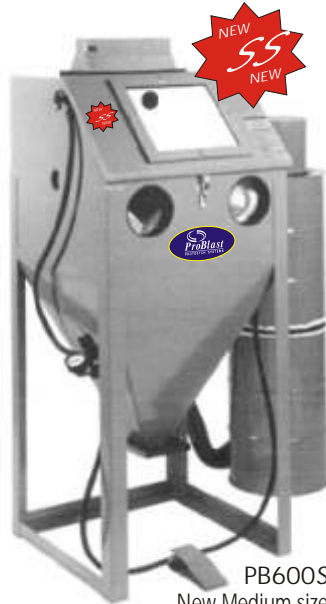
PB600SS New Medium sized 600 x 600mm work area