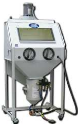
PB2034 PRESSURE POT SYSTEM Plenty of ex-Sydney Stock available

Sand Blast Glass, Acrylic, Brass, Stainless Steel, Wood, Ceramics, any metal, Stone.