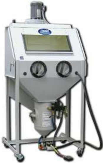
PB2034 PRESSURE POT SYSTEM

Phone: 02 9772 1999 Fax: 02 9792 2374 email:sales@premierawards.com.au